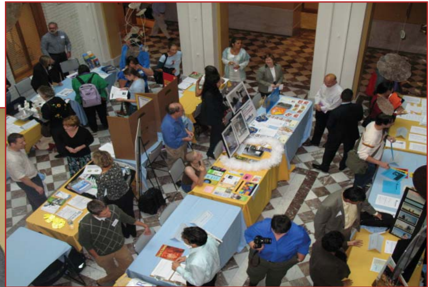
Community groups attend the final visionPDX Celebration in City Hall.