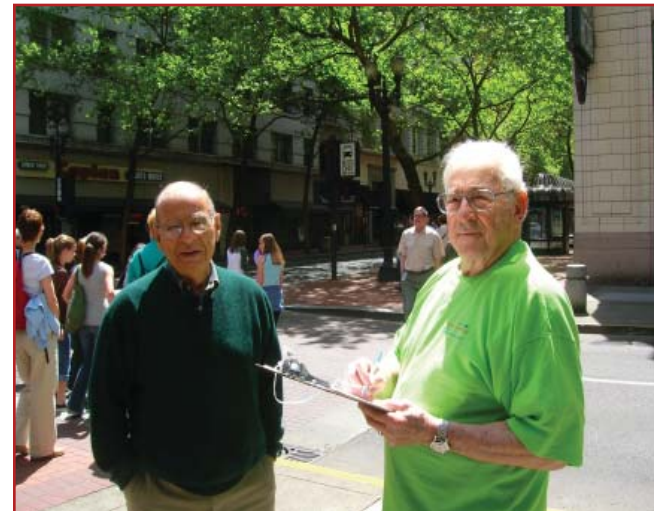
An Elders in Action volunteer hits the streets to survey community members.

Finally, the Community Engagement Report offers hope and reasons to continue to be inspired while involving community members in discussion and thoughtful decision-making. Through stories from participants as well as through the authentic sharing of trials and successes in the field, the report aspires to bring readers closer to connecting with one another, our neighborhoods and our government.